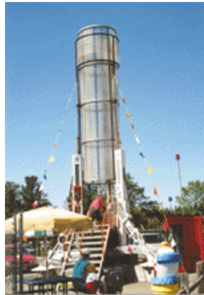
Blast toward the sky in the Space Probe at Paul Bunyan Center!